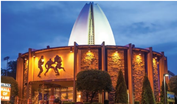
benkrut / Getty Images